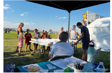
Some of our Child Care Staff at the Balloon Glow in Billings.