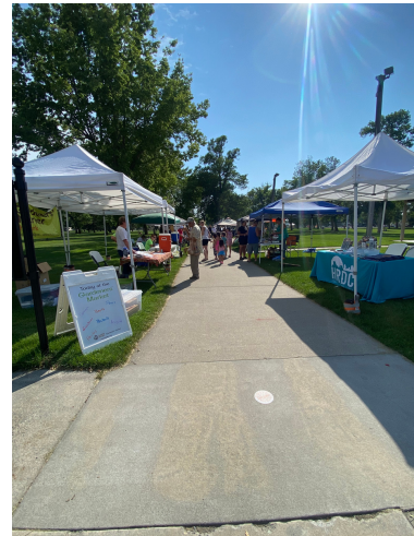
We attended the Billings Gardeners' Market in at South Park in July.