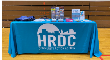
Here is HRDC 7's booth at the grand opening of the Eagle Seekers Community Center in Billings located at the Old Shrine Auditorium.

With summer come and gone, it was a blast getting out into the community this summer! Here are a few photos that show some of the events we attended in summer 2023.