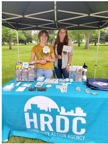
The Black Heritage Foundation of Billings had a Juneteenth Event that HRDC 7 was apart of.