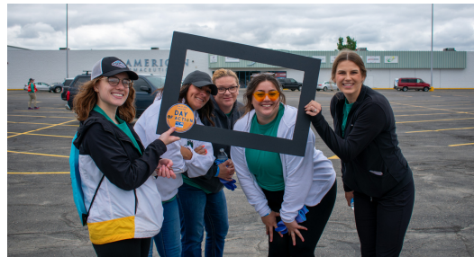
Several staff members participated in United Way of Yellowstone County's Community Day of Action on June 23.