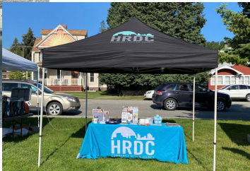
We went to a few Farmers Markets in Red Lodge, Hardin and Laurel to let community members know about our services!