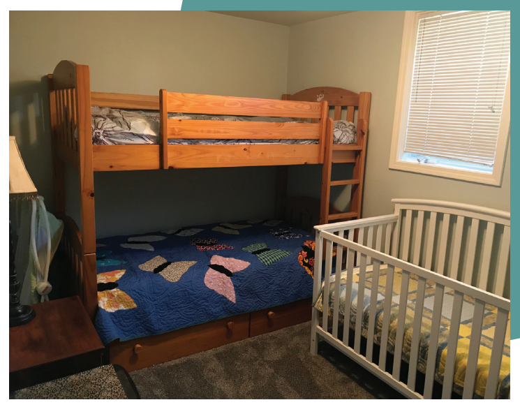
One of the bedrooms available to residents & their children.

Teen Parent Program, each of which have been vital to its program success. In 2017 Grainger generously donated $5,000 to Harmony House for much needed updates and improvements to the structure. Most recently, Saint Vincent Health Care Associate Giving Campaign donated $2,000.