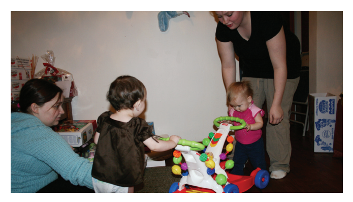
Christmas fun with gifts from some of the many generous community partners.

Harmony House Transitional Living Program provides up to 18 months of on-site transitional living with an additional six months of aftercare. The transitional living program offers two primary housing options; one for group residential housing for women and their children and a second for independent off-campus housing for men or youth couples with children. Women and their children have the opportunity to live in a five bedroom community house with other young female parents or may receive up